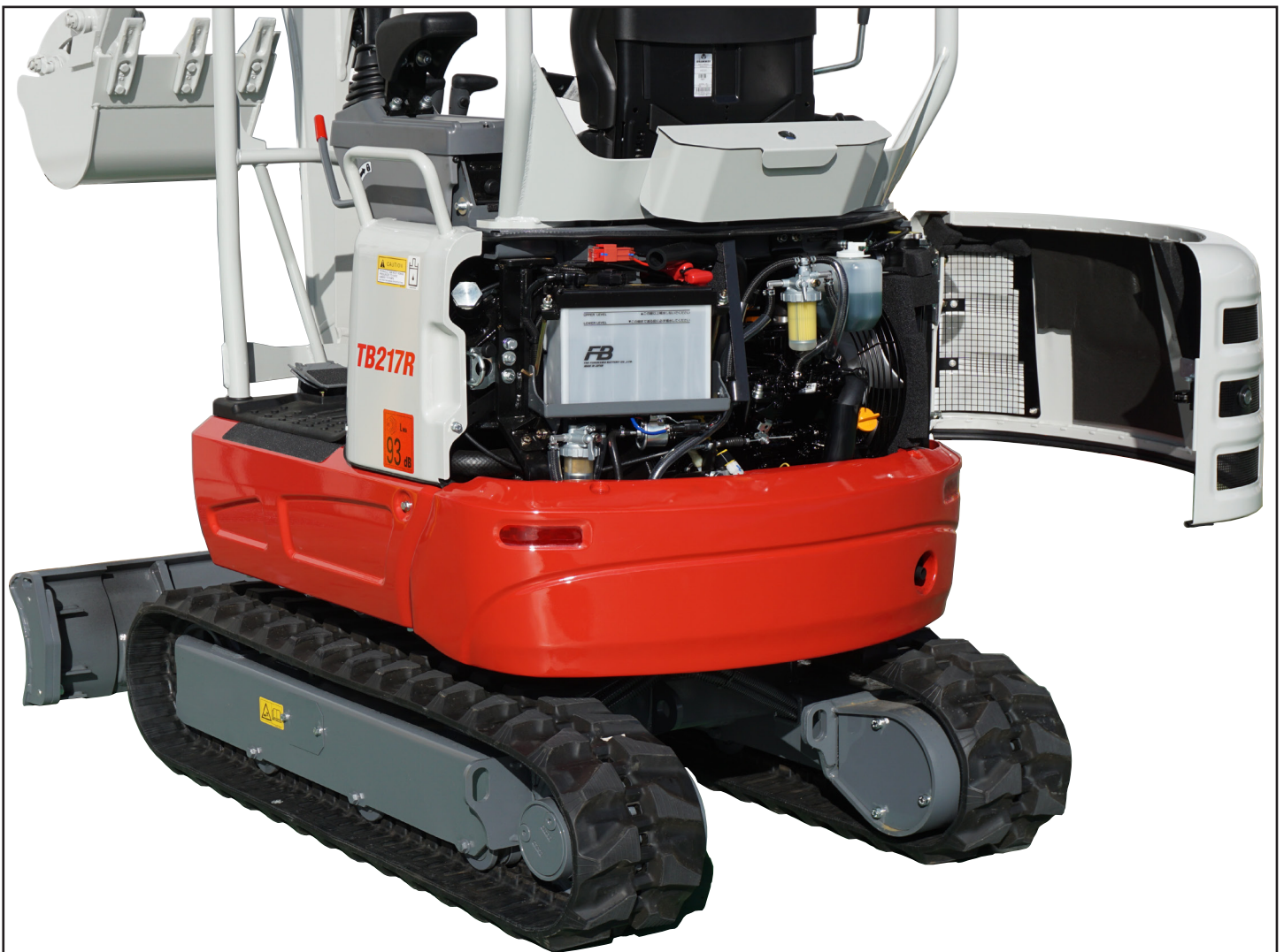
Easy Maintenance and Service Access

The TB217R is powerful, tough and versatile. This machine provides exceptional value and demonstrates outstanding performance.