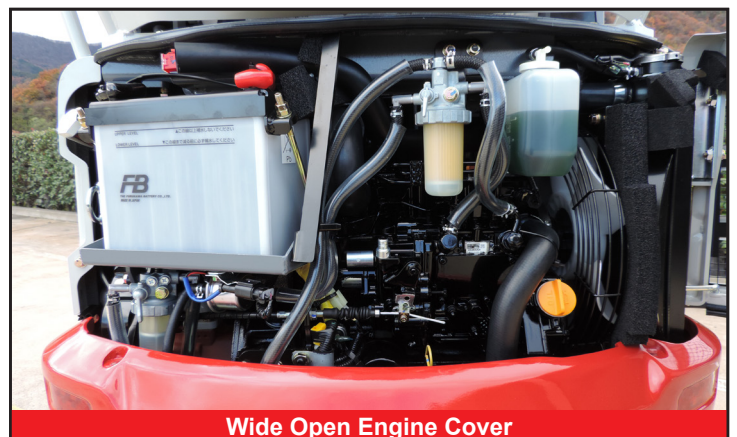
Wide Open Engine Cover

*Functions may not be available in all countries, so please consult your Takeuchi dealer for details.