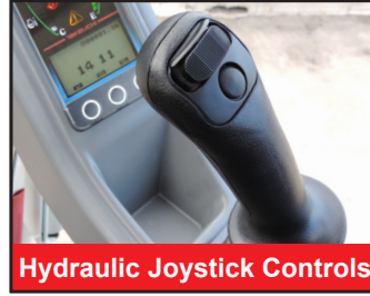
Hydraulic Joystick Controls