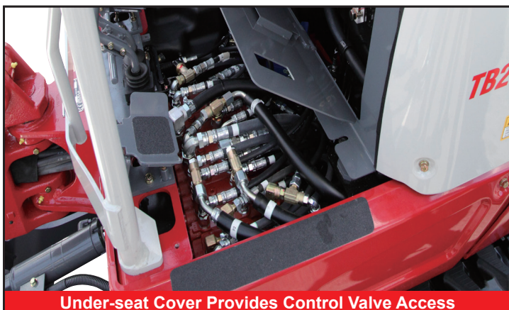
Under-seat Cover Provides Control Valve Access